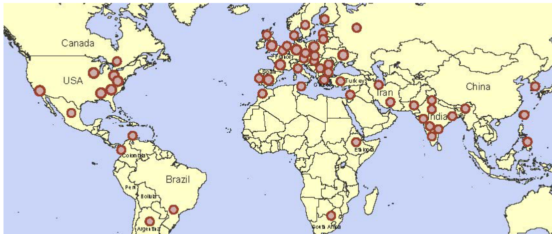
Figure 3. A map of the global participants location for the Europlanet Telescope Network Science Workshop.

In collaboration with Task 12.3 (Amateur Education and Training, Task 4 (Support of Ground-based Observations)) has organised the Europlanet Telescope Network Science Workshop. The meeting was held virtually on the 6-11 February, 2022. The goal of this workshop was to encourage community-led proposals and to highlight scientific results achieved with EPN-TN and other medium size and small telescopes. We invited interested astronomers and amateurs to participate, to learn more about the instruments offered, their capabilities and scientific potential. Sessions were distributed over three half-days and were dedicated accordingly: Day 1 - Solar System planets, Day 2 - Exoplanets, Day 3 - Minor Solar System Bodies. The meeting attracted participants from 43 countries (11 of them EU URS and 23 Non-EU). Among 210 participants, there were 63 early career researchers, 80 amateurs, 22 educators, and 43 senior researchers. 30% of participants were females. All the presentations have been recorded and are accessible via the Workshop Web page, i.e., http://mao.tfai.vu.lt/europlanet2022 , and on the YouTube channel of the Moletai Astronomical Observatory: