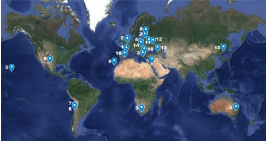
Figure 1. Location of the different facilities within the Europlanet Telescope Network.